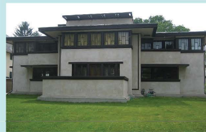
O. B. Balch House, 1911 611 N Kenilworth Ave