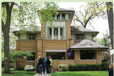
Rollin Furbeck House, 1898 515 Fair Oaks Ave