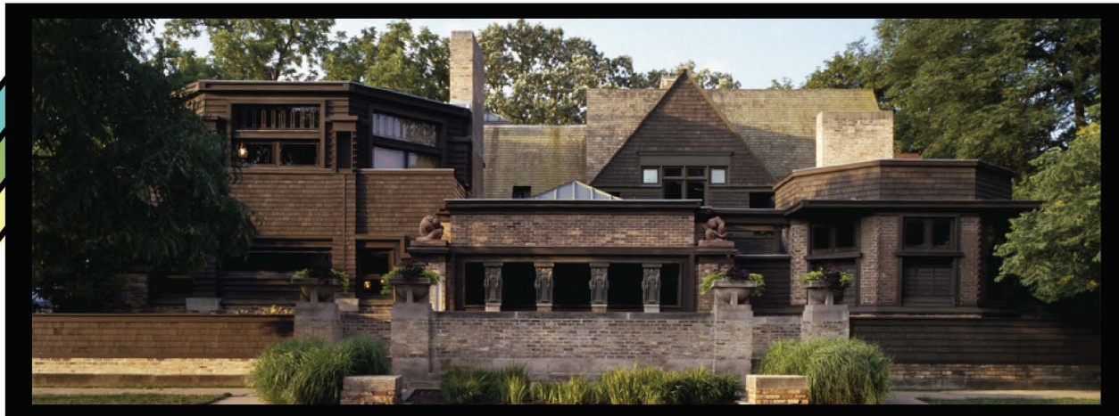
Frank Lloyd Wright Home and Studio, 951 Chicago Avenue