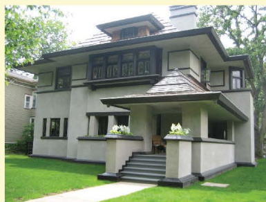
Hills-DeCaro House, 1900 313 Forest Ave