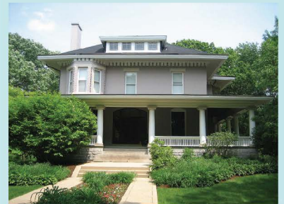
W. H. Copeland House, 1909 400 Forest Ave