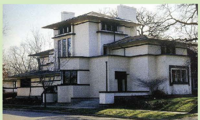
William Fricke House, 1901 540 Fair Oaks Ave