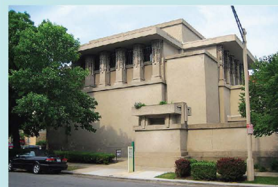
Unity Temple, 875 Lake Street (not on route but near the course)