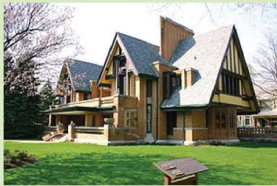
Nathan G. Moore House, 1895 333 Forest Ave