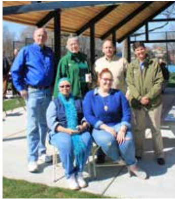
Lindberg Park opening, April 11, 2015.

Early plantings in the East Ave. Bioswale.