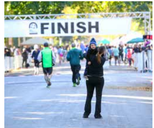
The Frank Lloyd Wright Races took place on October 18, 2015.