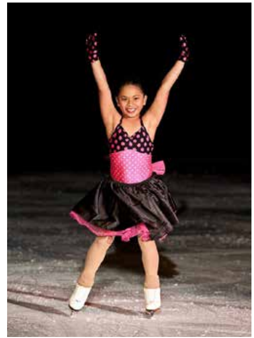
RCRC Remix'd was the theme of the 2015 ice show.